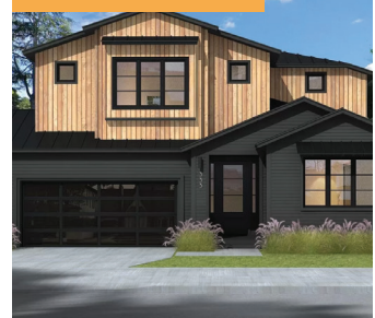
333 MARMONA DR. MENLO PARK - 4BD/3BA