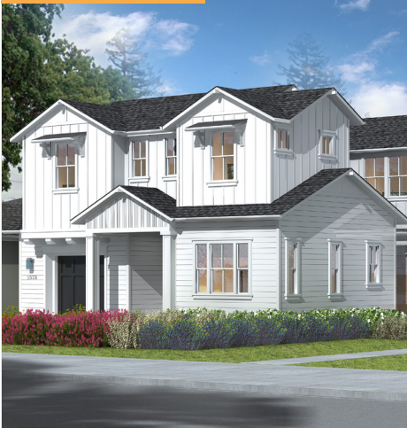
SAN CARLOS, WHITE OAKS 4BD/4BA - TRADITIONAL