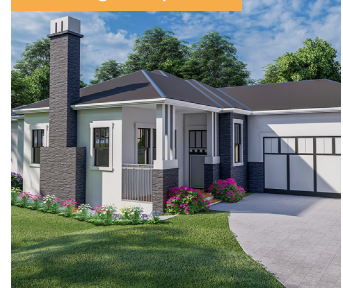
535 FRANCISCO ST. EL GRANADA - 4BD/3.5BA