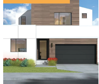
106 BAYWOOD AVE. MENLO PARK - 4BD/3BA