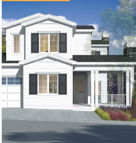
SAN CARLOS, ALDER MANOR 4BD/3BA - TRADITIONAL