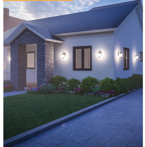
DOWNTOWN SAN CARLOS 5BD/4.5BA - CRAFTSMAN