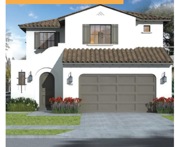
646 EHRHORN AVE. MTN VIEW - 4BD/3BA